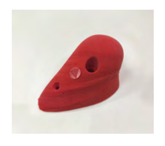
SikaBiresin® Colour Paste for good UV stable pigmentation

This range offers beside the resin itself a full package from mould making silicones to colour pigment.